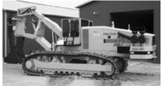
Inter-Drain 2050 GP